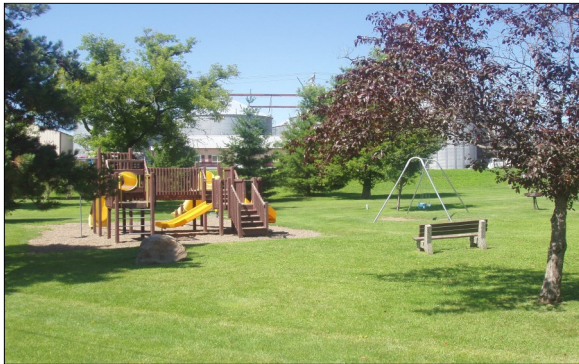
~Play Ground Area~

Maquoketa Area Chamber of Commerce 124 South Main Street, Suite 2 Maquoketa, IA 52060 563-652-4602 or 800-989-4602 www.maquoketachamber.com